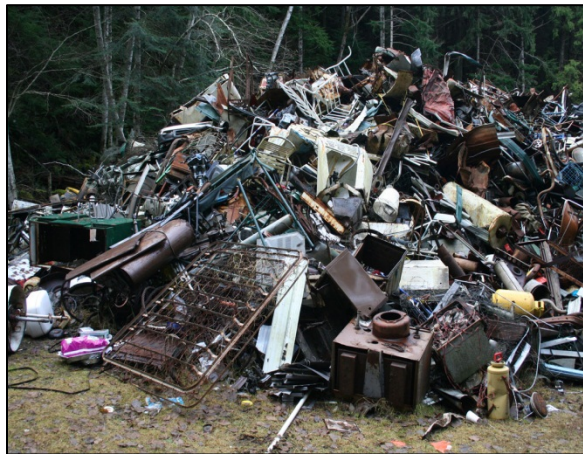
Figure 7-1 Scrap Metal Pile at the Landfill

The selection of a preferred option is anticipated as part of the plan implementation process, and will be undertaken with input from an advisory committee.