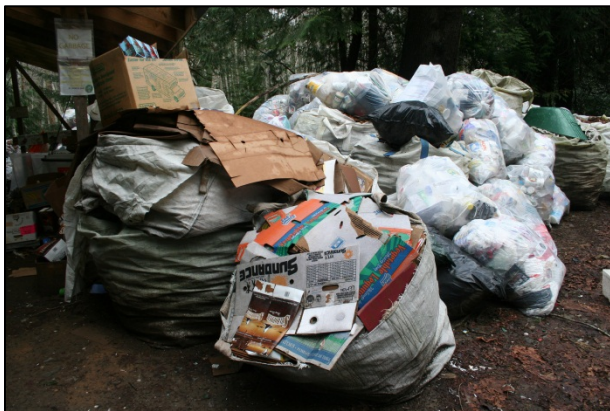
Recycling Depot: Sorted & Bagged Recyclables