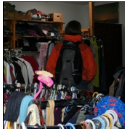
Free Store: Inside