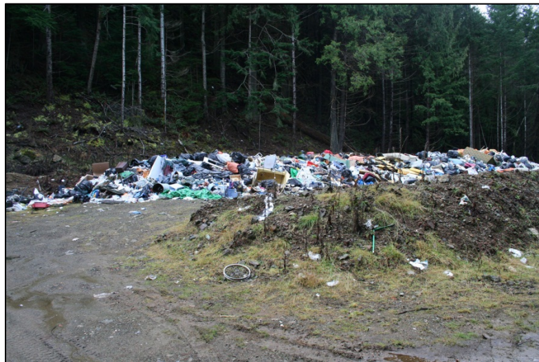
Figure 10-1 The Lasqueti Island Landfill

The trench-style landfill is used only for the disposal of municipal solid waste. There is minimal food waste in the landfill, as evidenced by lack of birds or other vectors observed at the site. The waste is not compacted but is covered with soil roughly every two years. There has been no environmental monitoring of the site. At present, this operation does not meet BC Ministry of Environment criteria for landfills or the requirements of its landfill permit.