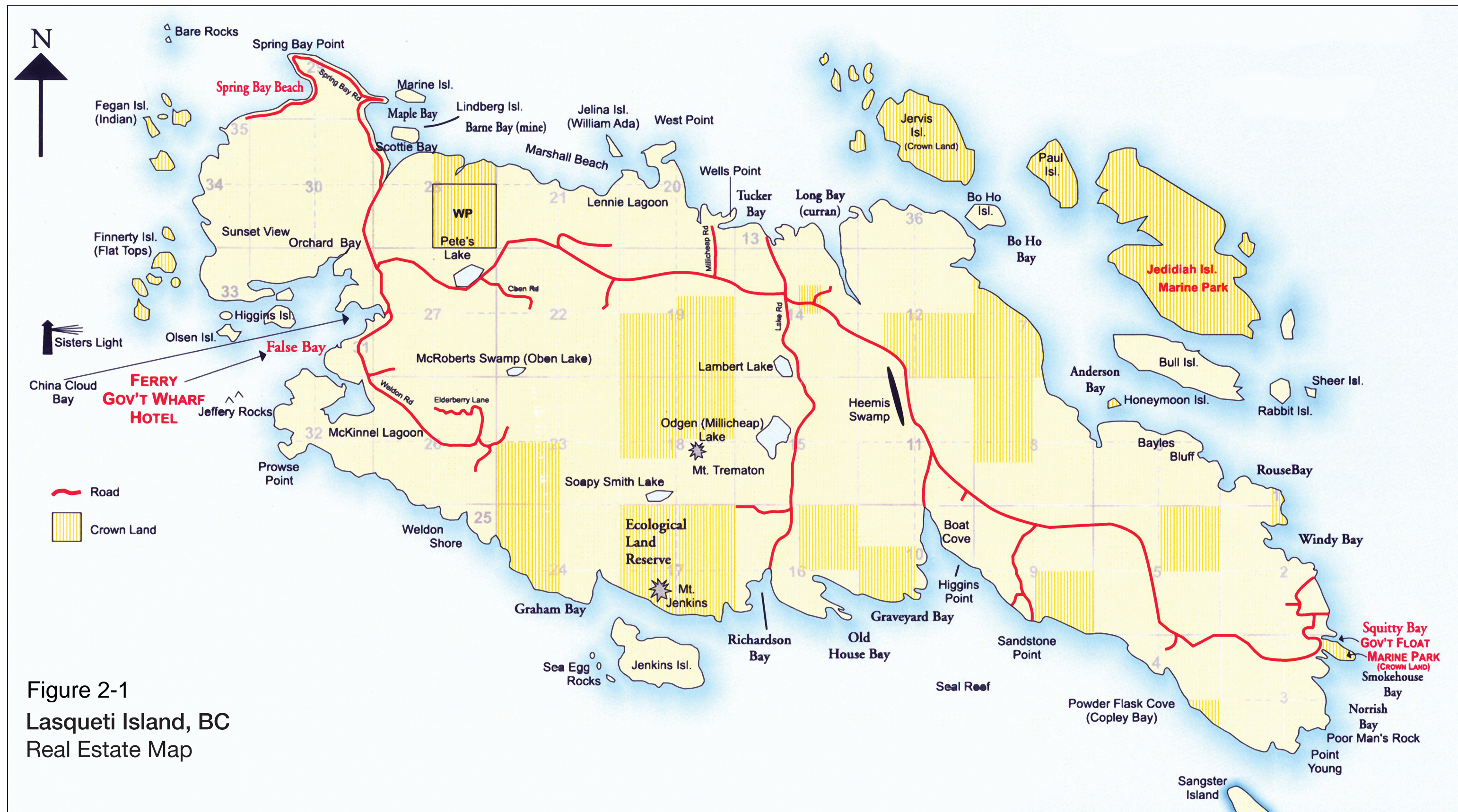
Figure 2-1 Lasqueti Island, BC Real Estate Map