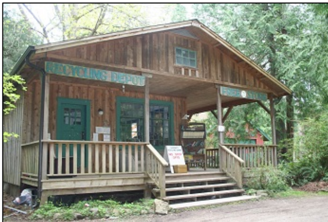
Free Store: Outside