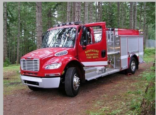
This truck weighs about 35,000 lbs (17 tons) fully loaded, is 11 feet (3.4 m) wide and is 28 feet (8.6m) long.